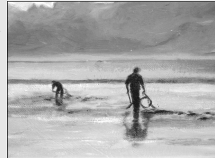
Joan Hollander: Working the Sea , oil on panel, 2005.

You'll also find that area galleries offer great values, provide a wide range of price points, and are often comfortable with letting you bring a work home to “try it before you buy it.” Many galleries offer extended payment plans that make it easier to own art than to buy a mattress. Gallery owners love art—and love sharing it with others. Don't feel intimidated. You'll find that Grand Rapids' gallery owners treat “emerging buyers” with just as much respect as they give emerging artists.